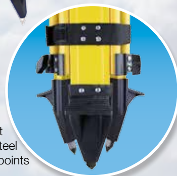
Hardened die-cast tripod shoe with steel replacement points