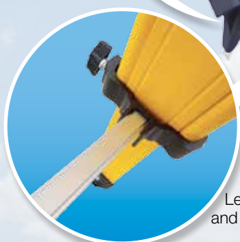
Leg brace and wing nut