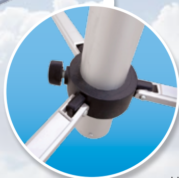
Heavy duty braced centre support