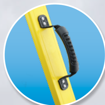
Balanced carry handle