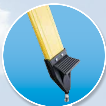
Large tripod feet