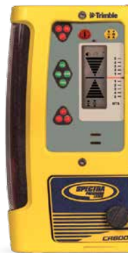
CR600 Combination Receiver can be machine or rod mounted for increased productivity applications