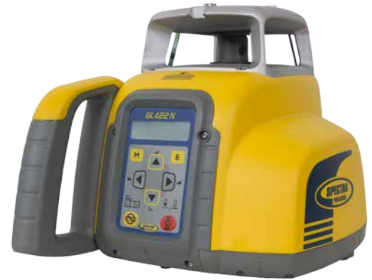
GL412N/GL422N features a strong metal sunshade