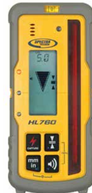
HL760 Digital Readout Radio Receiver to measure and display beam location