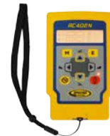
RC402N Radio Remote Control for all applications